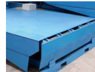
Height Adjustable Lip Plate