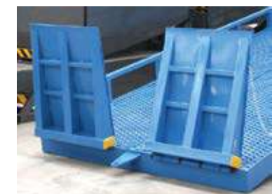
The Board, The Vehicle Can Go Up Easily