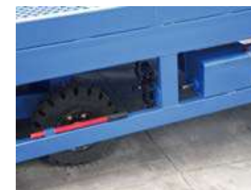
Labor-saving Pressure Bar And Pumping Station