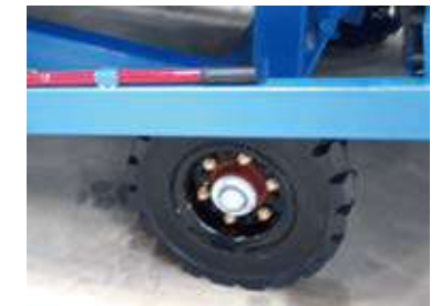
Solid Tires, Wear-resistant